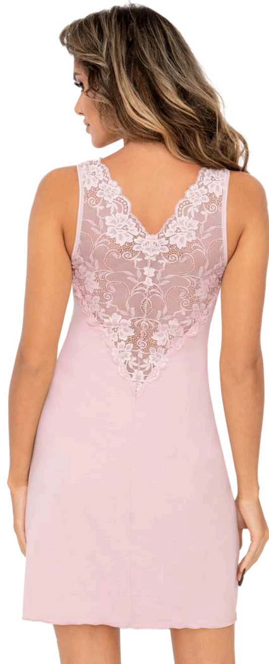
KRISTINA powder pink

Size: S-XXL Composition: 90% viscose 5% elastane 5% polyester