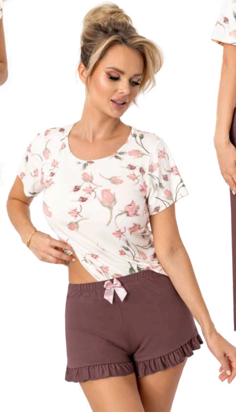
AMARIS short dark plum