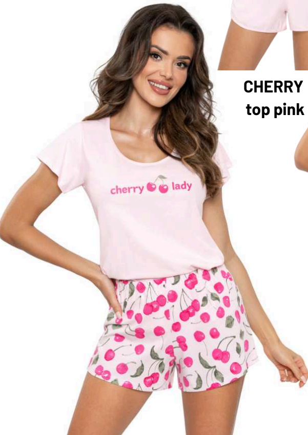
CHERRY short pink